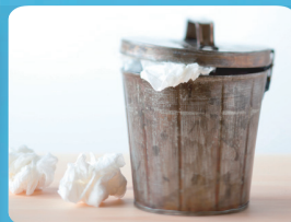
Garbage odor etc.